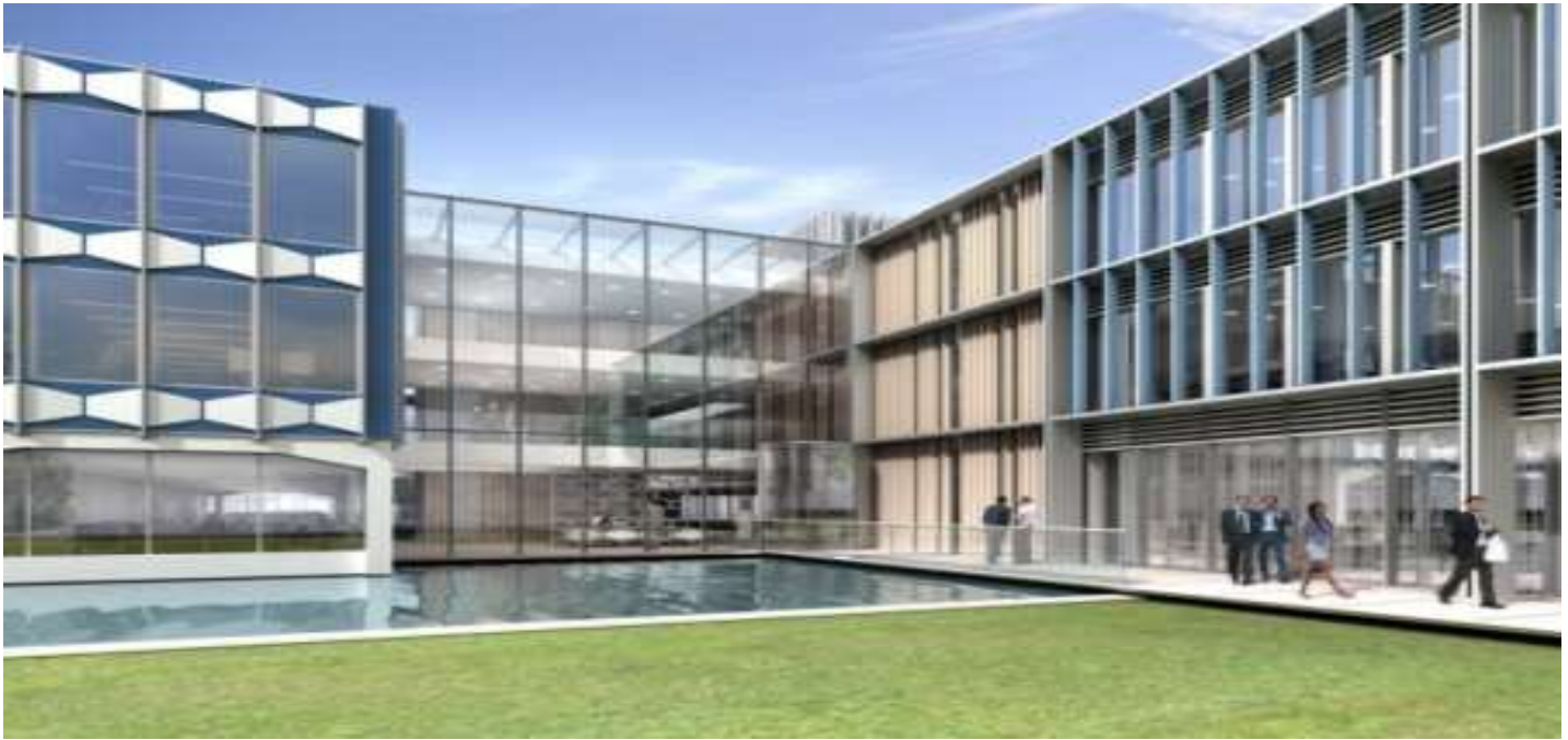
Main Entrance to the campus Administration and Recreation and Auditoriums